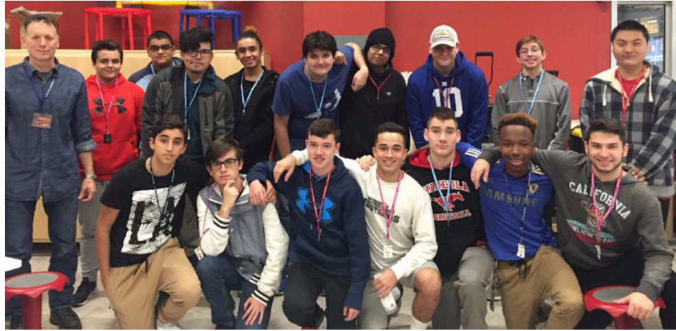
Mineola H.S. 10th graders entering the New Media Technology certificate program