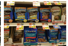
Tuna fish in pull-top packaging