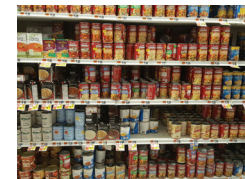
Ready to eat soup with pull-tops—no can opener required

Proteins: Tuna in easy-tear packages or in the kits with crackers, chicken or salmon