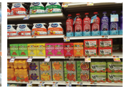
Single-serve fruit and vegetable drinks