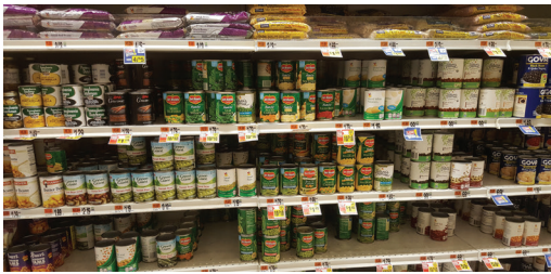
Above: Easy, healthy finger food snacks and canned vegetables with pull-tops